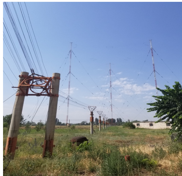
Central Asia transmitter sight