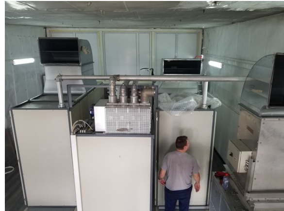
Combining two high power transmitters for increased range